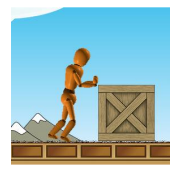
Sam pushing and box moving