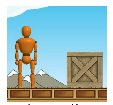
Sam not pushing