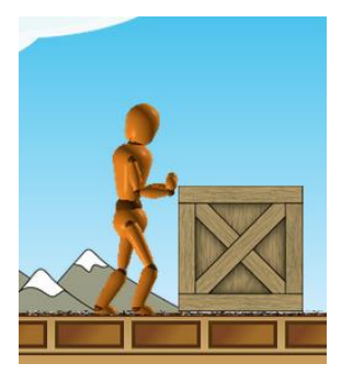
Sam pushing but box not moving